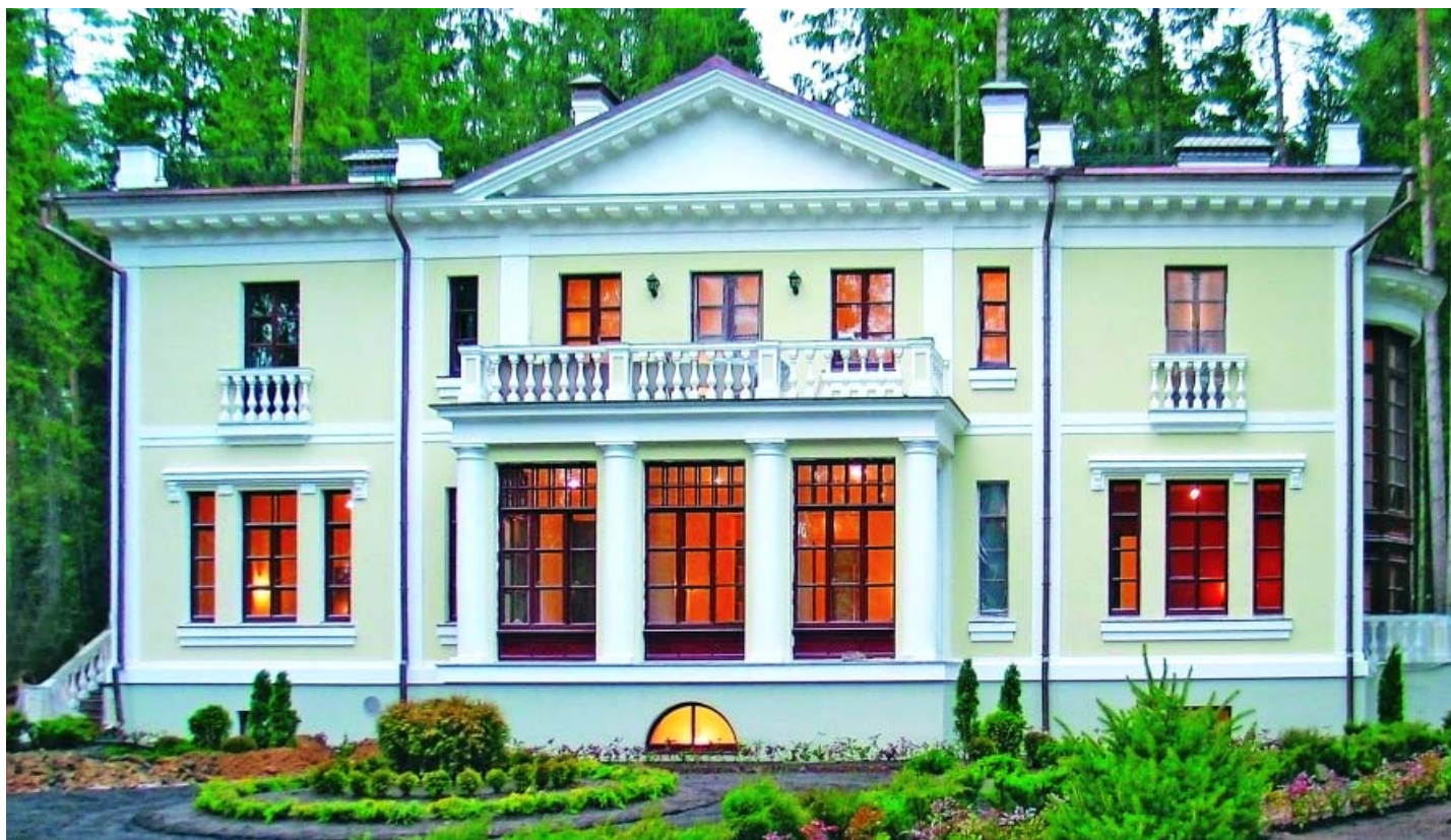
Кирпичный коттедж, 300 кв.м. На участке 25 соток ландшафтный дизайн, пруд.